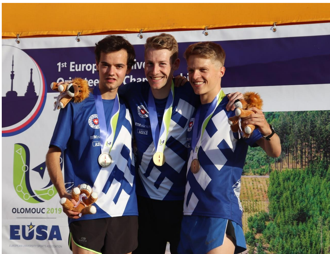
Swiss Federal Institute of Technology in Zurich dominated in the sprint distance.