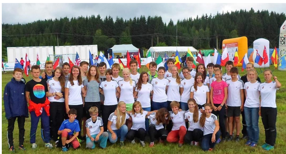
O-Academy in 2014 during WUOC.