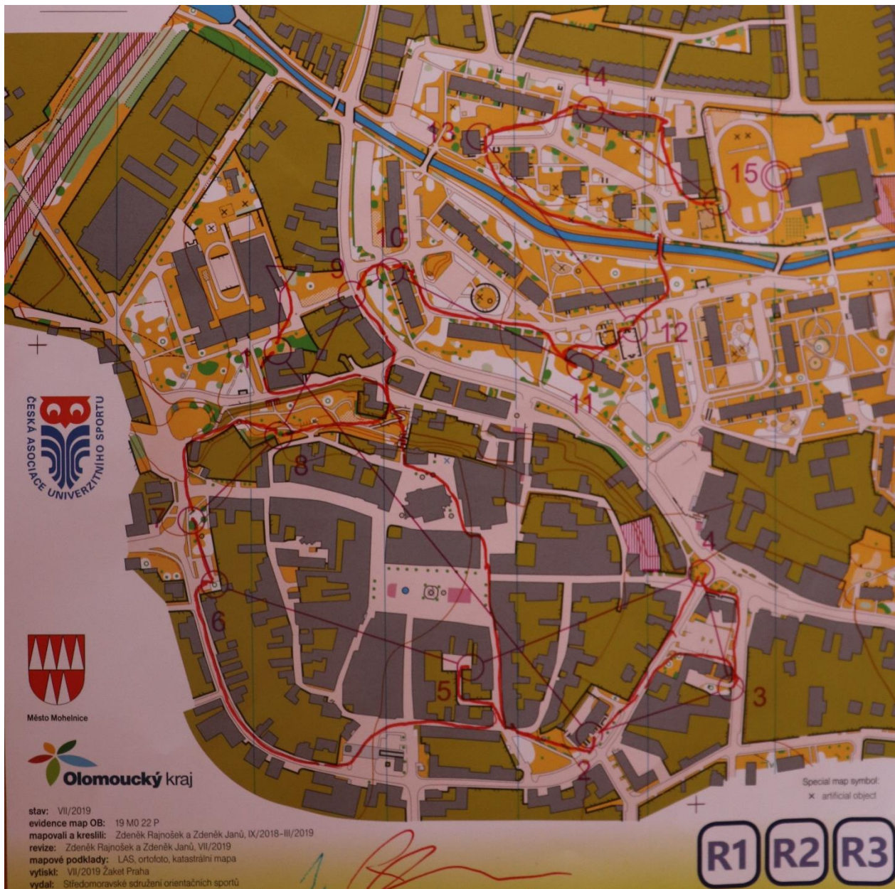
Winning route choices of Riccardo Rancan