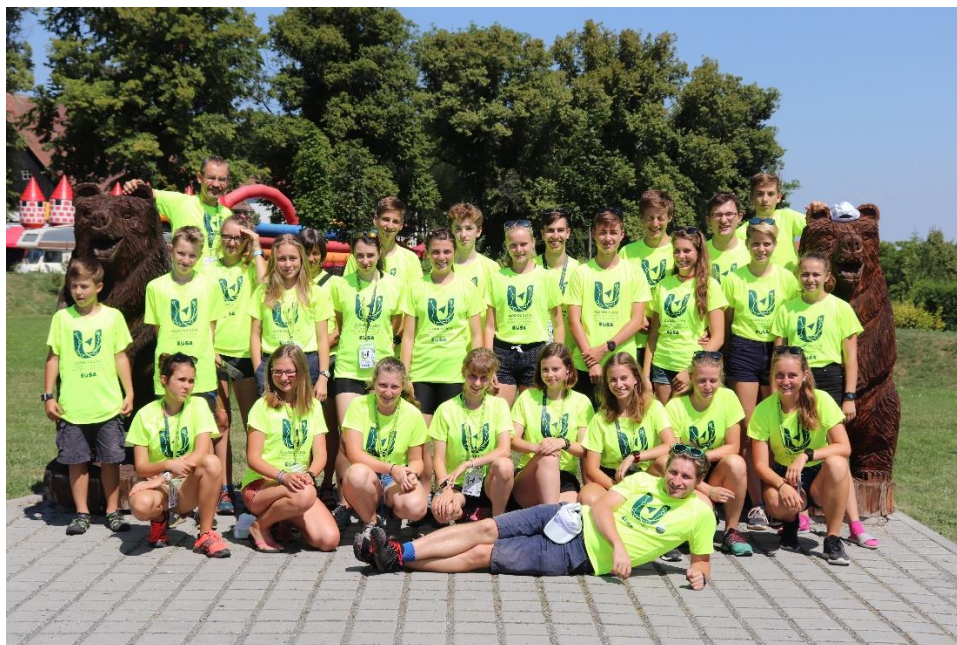
O-Academy in 2019 during EUOC.