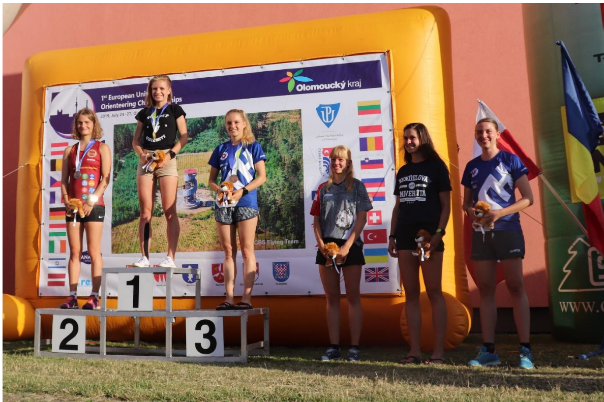
The best six women in the sprint race.